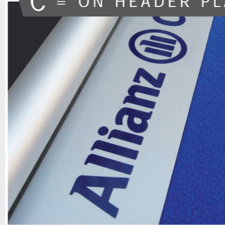
C = ON HEADER PLATES

E = Printed Logos applied directly to pin board fabric surface