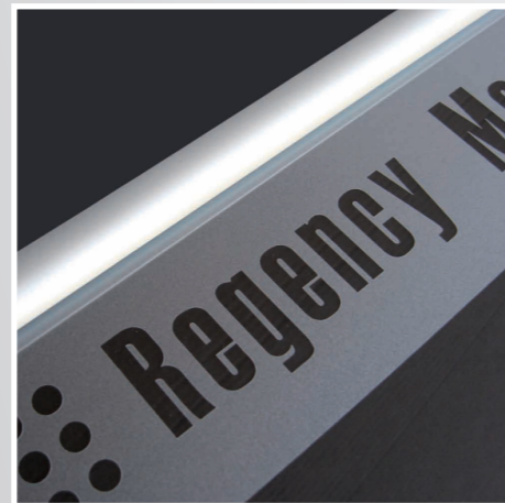
D = ON HEADER PANELS