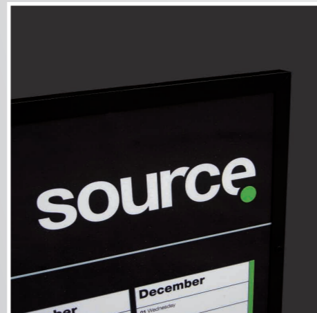
E = ON PIN BOARD FABRIC